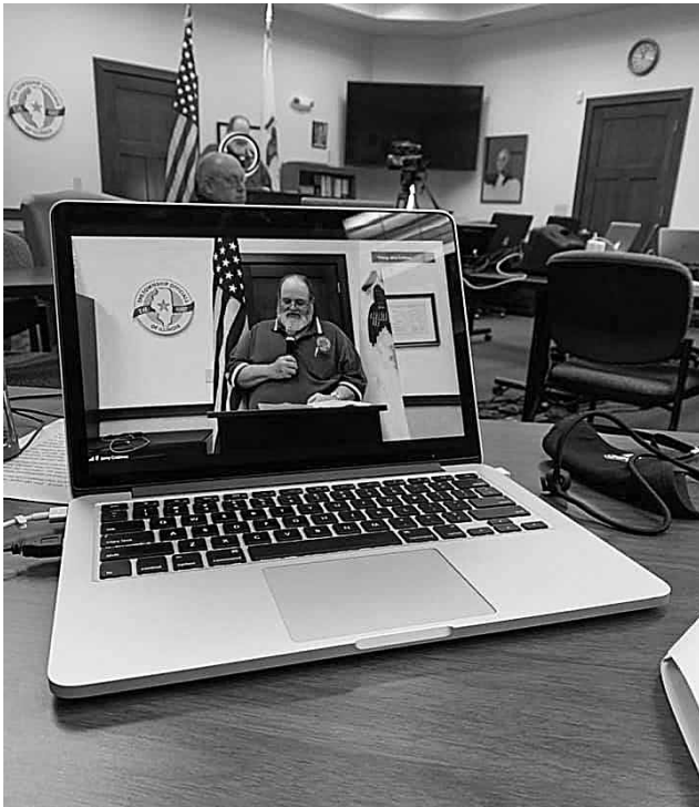
INSIDE THE CONTROL ROOM for the virtually held 113th Annual Educational Conference.